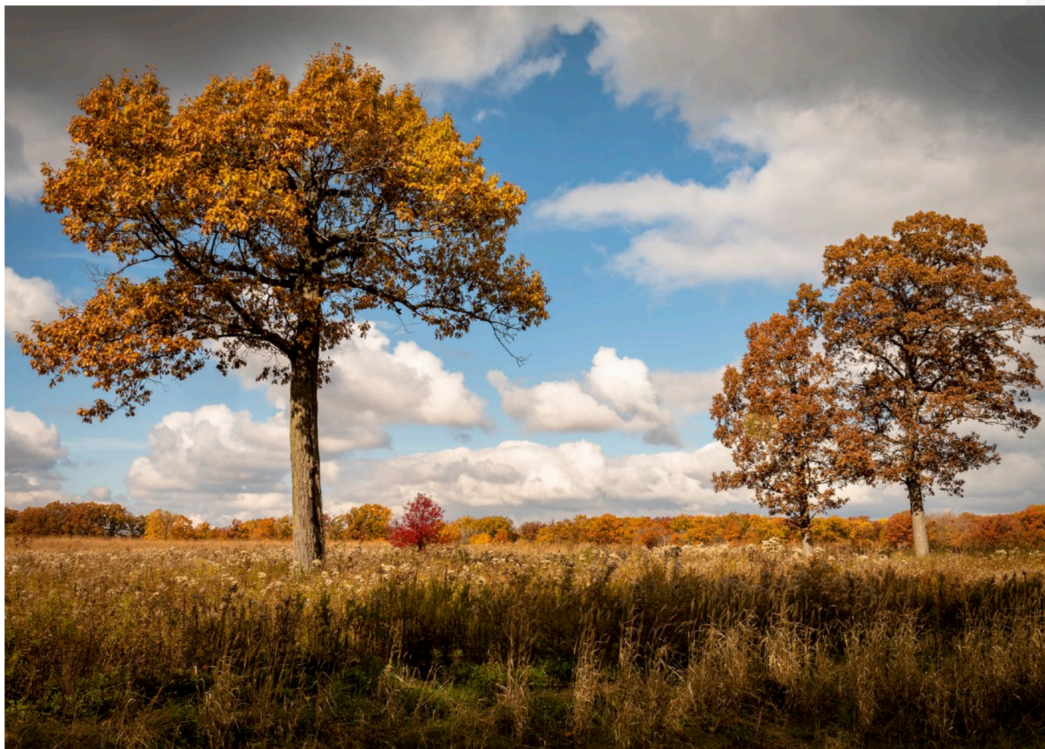
Paul Lucas, USA | Fort Sheridan Lake CFP, Lake Forest, Illinois, USA • Nikon D810, Nikon 24-70mm f/2.8, f/16, 1/60sec, ISO 100

I jumped in the car and drove 15 minutes north to the forest preserve. Luckily it was less than a 10-minute walk from the car to the tree. The sky was changing quickly. I set up my camera and tripod and worked on various composition ideas. Just after I took this picture, the clouds moved in, covering the sun. I waited another 30